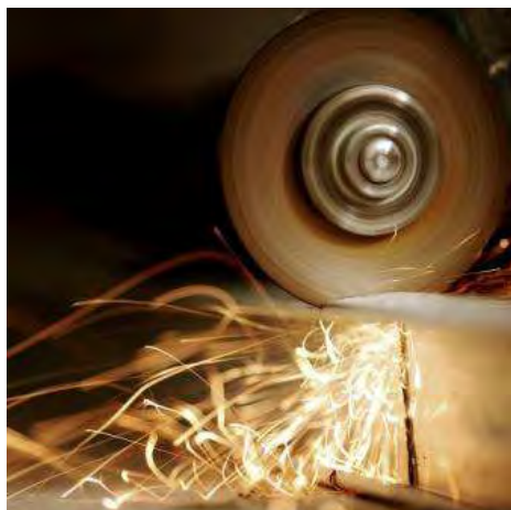
Free Cuts for Shipping

Parker Steel is well equipped with a high tech, computer operated Marvel™ band saws for your production cutting needs.